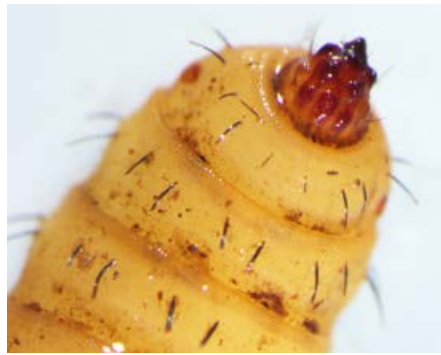
Larvae and soldier fly