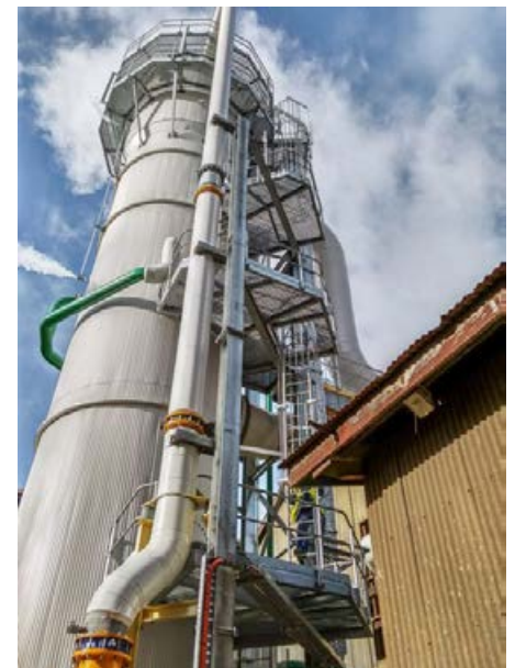
Falling-film tube evaporator at the Bingera Mill

“While greater care is needed in the cleaning program for the FFTE, the test program did not show any major disadvantages compared with a Robert evaporator,” he said. ■