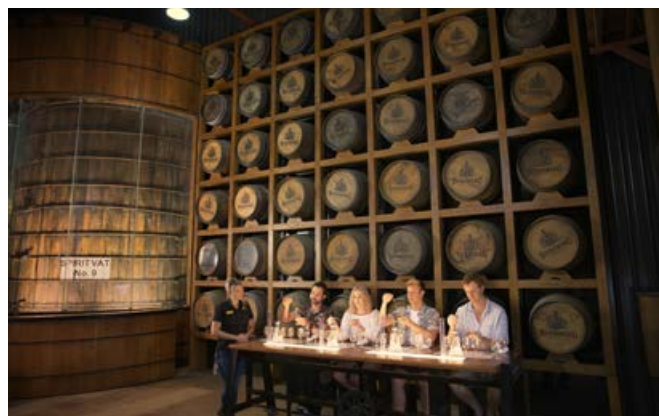
Bundaberg Rum Distillery.

“ Throughout the region there is a sense of history mixed with wilderness adventure, rural experiences and warm country hospitality.”