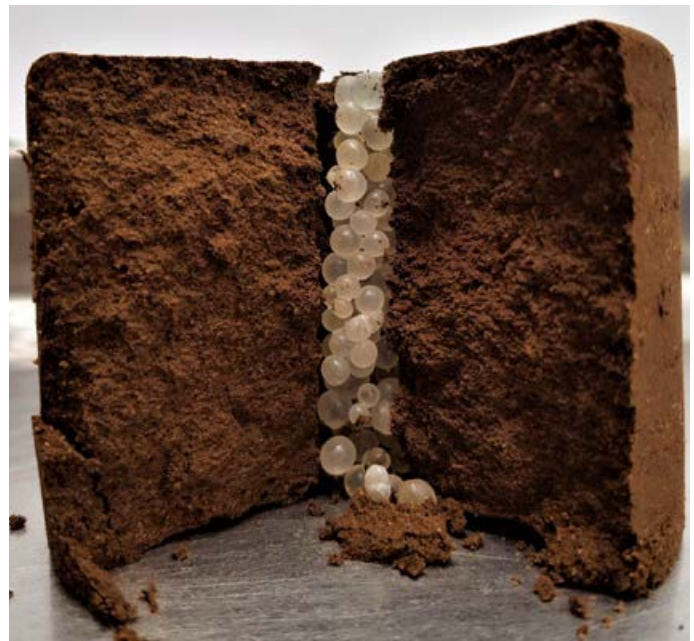
Above: A band of polymer-coated urea (56 days after application) in a soil core